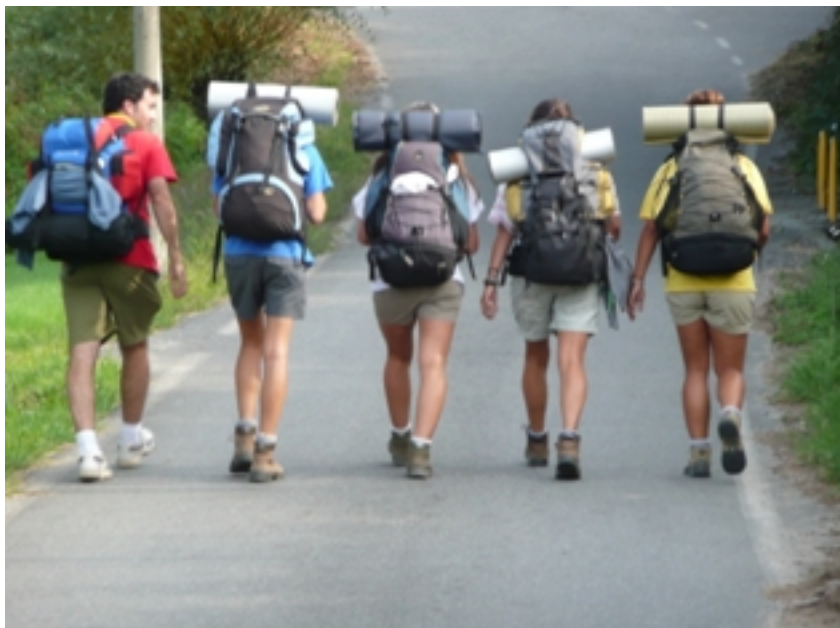
Setting out on the Camino Portugués