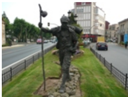
Pilgrim Statue in Padrón

Pensión Glorioso. Picaraña. Tel 981 80 31 81