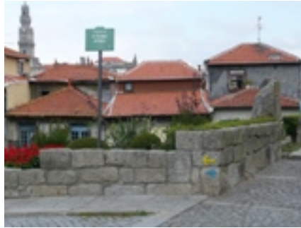
The first yellow and blue arrows

With your back to the West door of the Cathedral proceed down the Calçada de Pedro Pitões as indicated by the first yellow arrow.