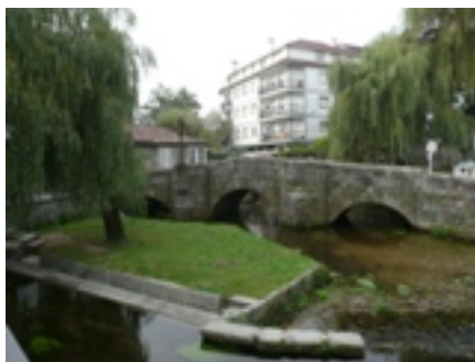
Bridge leaving Caldas de Reis

Cross the Puente Romano and KSO passing the Capilla de San Roque with a fuente on your Left. Cross the main road carefully and proceed up Right side to veer Right when indicated.