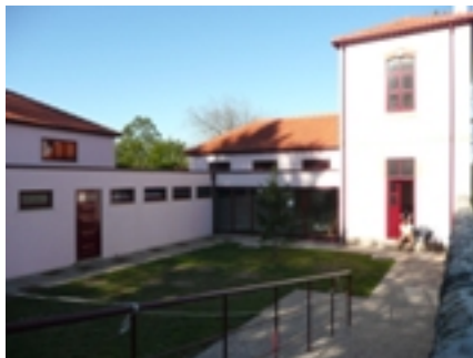
Albergue in Rubiães

Two large dormitories, lounge, large sitting out area and a small kitchen. There are two restaurants within a kilometer or so.