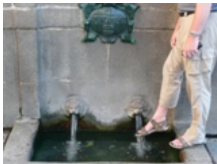
Pilgrim bathing feet in thermal waters

Sign now clearly states that feet are not allowed in this fountain.