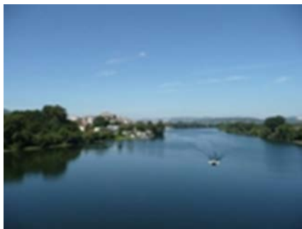
Spain getting closer crossing the bridge to Tui

Remember to change your watch + 1 hour to Spanish time