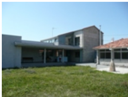
Albergue at Briallos

The route comes back to the N550 at the roundabout at: