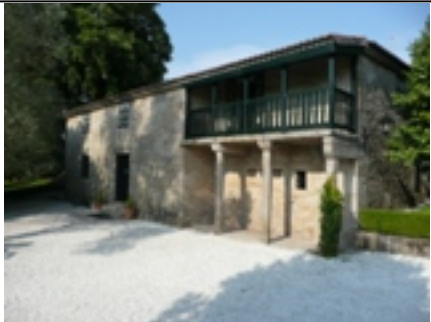
House of Rosalía de Castro